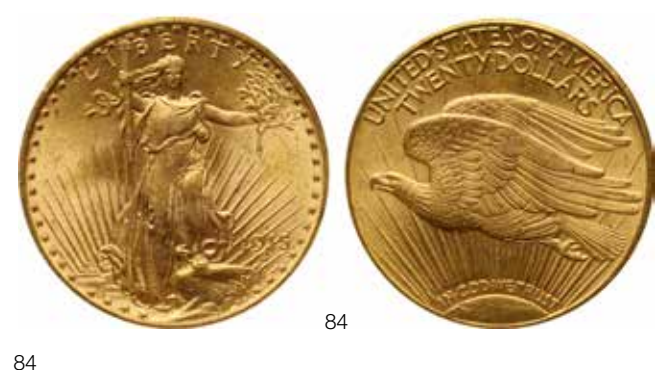
1915-S $20 MS63 NGC Sharp and lustrous with a pleasing green-golden finish. (PCGS 9168) $1,200 - 1,400

The mildly granular surfaces, common to most pre-1920 double eagles, are apparent here and sparkling mint frost is laid across each side. Minimally abraded with especially attractive golden luster. Housed in a green label PCGS holder. (PCGS 9166) $1,300 - 1,500