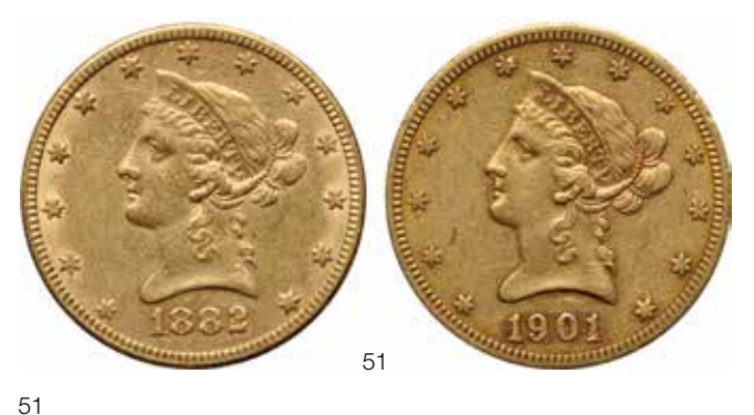
1882, 1901 $10 Both appear to be average circulated examples. Very Fine $1,100 - 1,300

A pair of average circulated examples of the Liberty eagle. Very Fine $1,100 - 1,300